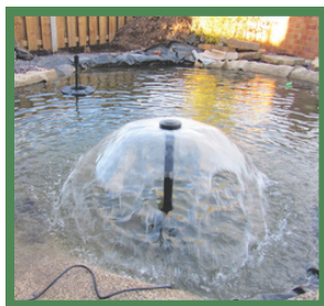
A - Bell

Smaller models include 2 fountain heads (A, B) and a 12/20mm hose tail; larger models (3000/4000) have 3 heads (A, B, C) and larger hose tails.