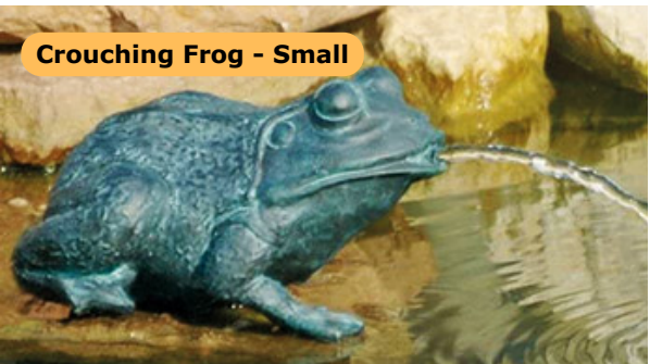
Crouching Frog - Small