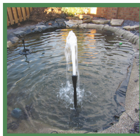
C - Geyser Jet