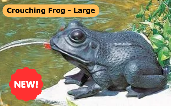
Crouching Frog - Large