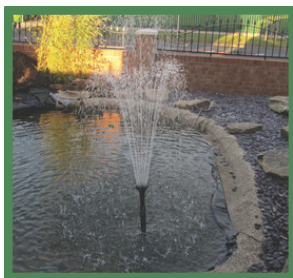
B - Tiered Spray