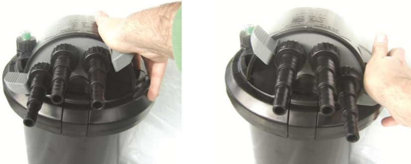
The movement of the cleaning handle from 'work' to 'clean' on PXPf04500 to PXPf12000

Turn to the 'clean' position, the water flow is reversed and exits through the waste outlet. This waste water should run to waste by attachment of a suitable length of hose.