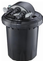
PXPF04500 – PXPF12000