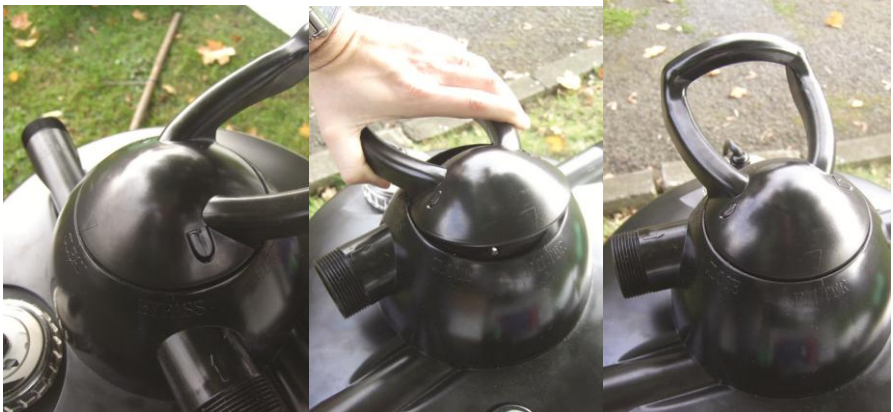
PXPf20000 to PXPf30000, triangle graphic on handle set to 'FILTER', to clean push handle down and turn handle round so triangle graphic is at 'CLEAN' position

Turn the handle back once the water from the filter runs clear (about 30 seconds).